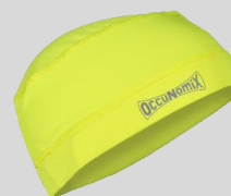
Skull Cap TD900