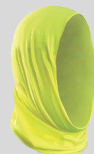
Neck Gaiter TD800

HQ/EASTERN WAREHOUSE | PORT JEFFERSON, NY