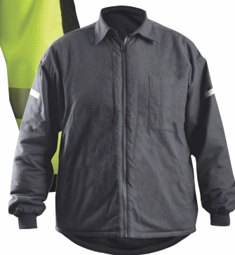
WEARABLE FLANNEL JACKET

HQ/EASTERN WAREHOUSE 585-52 North Bicycle Path Port Jefferson Station, NY 11776