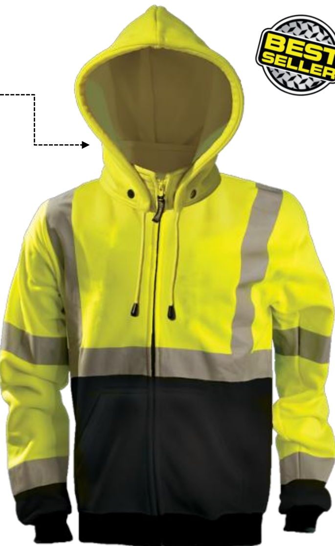
INTERNAL HIDDEN POCKET FOR PHONE OR OTHER PERSONAL ITEMS

CHECK OUT THIS VIDEO ON OUR SUSTAINABLE PRODUCT LINE