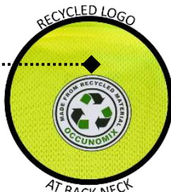
AT BACK NECK