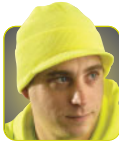
1075-HVY 100% acrylic Jeep cap Easy-to-See Yellow