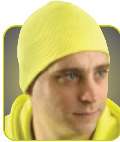
1091-HVY 100% acrylic shell, 100% Thinsulate lining. Beanie. 40 grams Easy-to-See Yellow