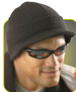
1075-068 100% acrylic Jeep cap Black