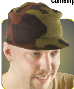
1076-CAMO 100% acrylic Engineer Cap w/ brim