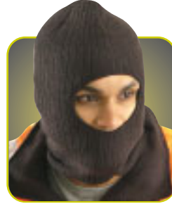
1090-068 100% acrylic shell, 100% Thinsulate lining. Open face mask. 100 grams Black