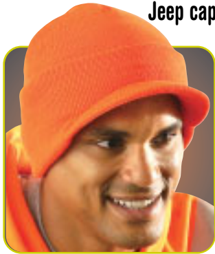
1075-HVO 100% acrylic Jeep cap Easy-to-See Orange

Jeep caps with peaks. Classic, sturdy and comfortable