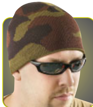
1063-CAMO 100% acrylic Beanie